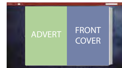
option 3 + inner cover